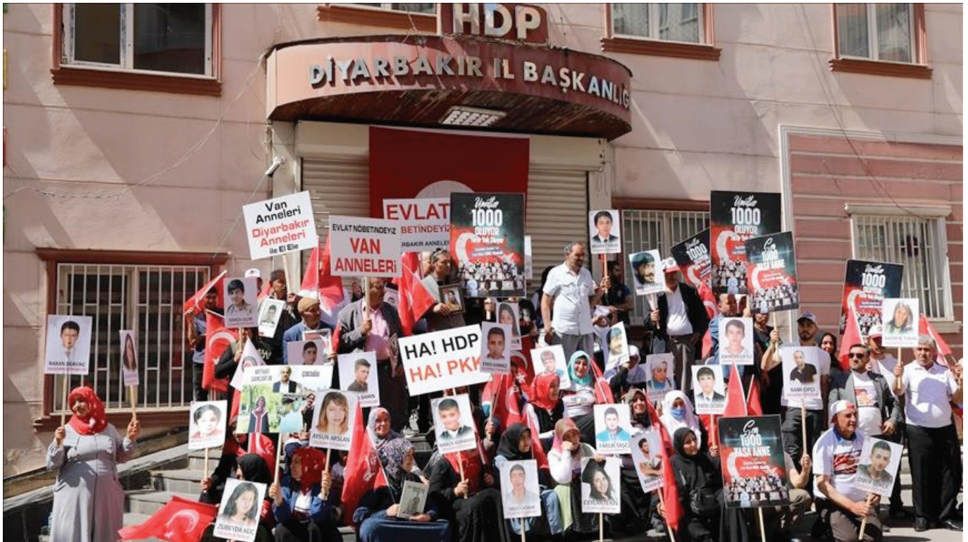
Diyarbakir Mothers on Duty 5

Analysing the recruiting process, the organization obviously tries to weaken children's ties with their family with slogans such as "The word family is forbidden" and "Comradeliness is superior to family". Within this process the terrorist organization tries to transform children from the ecology of normal life to the ecology of the terrorist organization where they can be radicalized. With this transformation, the organization aims to get rid of family ties, which are the most important obstacle in the abuse of children. Within the scope of the fight against the abuse of children and this tactic of the organization, as a result of persuasion efforts of the security forces and the sit-ins of Diyarbakir mothers in front of the HDP (People's Democracy Party) Diyarbakir provincial building, in 2019, 273 members of the organization, 243 in 2020, 199 in 2021 and 113 members of the organization in the 11-month period of 2022 escaped from the organization and surrendered. The support and importance of families in these activities is indisputable. Currently, 39 families continue their sit-ins in order to save their children from the organization. As more families participate and support these activities and resist their children being recruited by the organization, it is predicted that the organization will have increasing difficulties in recruiting staff for activities where children are abused.